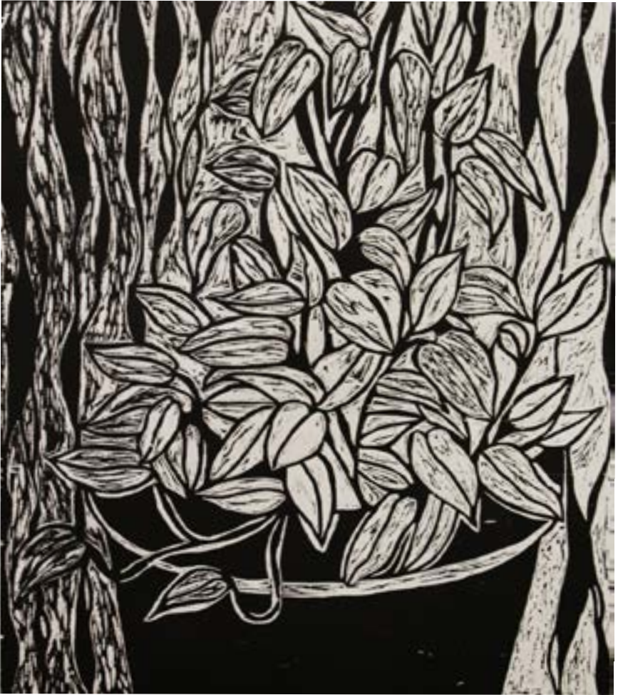
Gretchen Cortez Untitled | Woodcut