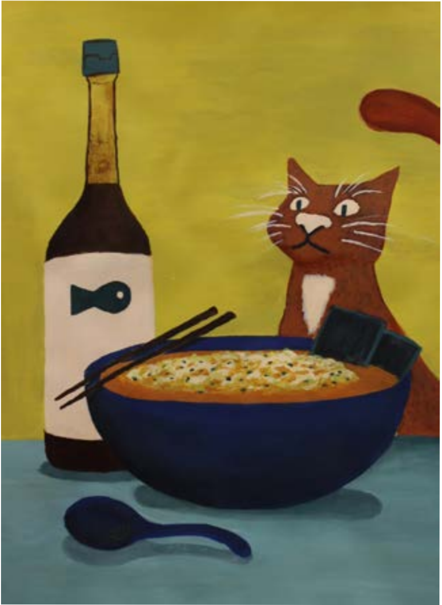
Mahlivanh Fleckenstein Noodles | Acrylic on Paper