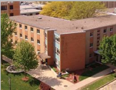
FIRST-YEAR STUDENT HOUSING

Marian Hall also offers students easy access to the Student Union and the dining facilities as they are connected.