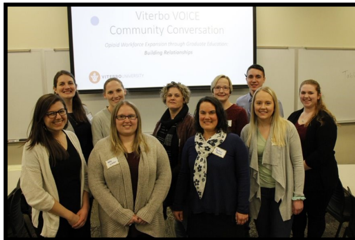
First year VOICE Grant recipients

"Preparing the next generation of mental health professionals to combat opioid and other substance abuse with evidence-based practice is imperative for everyone."