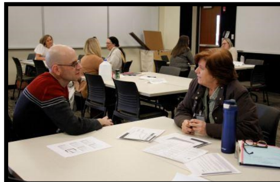
Roundtable presentations at the 2020 VOICE Summit