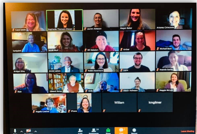
CSI Spring 2020 Initiation

Our chapter has over 45 active members including current students, alumni, and faculty. We focus on promoting excellence in the profession of counseling and hope to get members more involved in professional development, community engagement, wellness, and more.