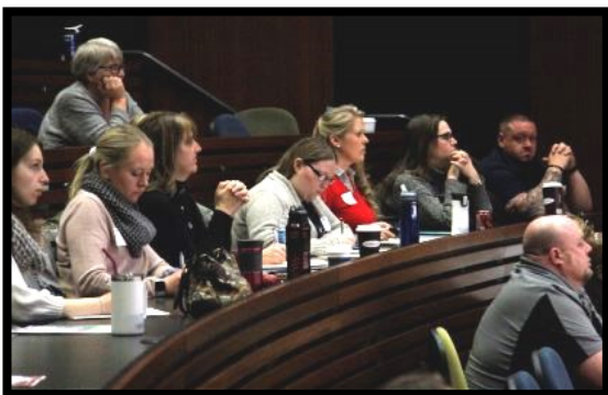
Audience at the 2020 VOICE Summit