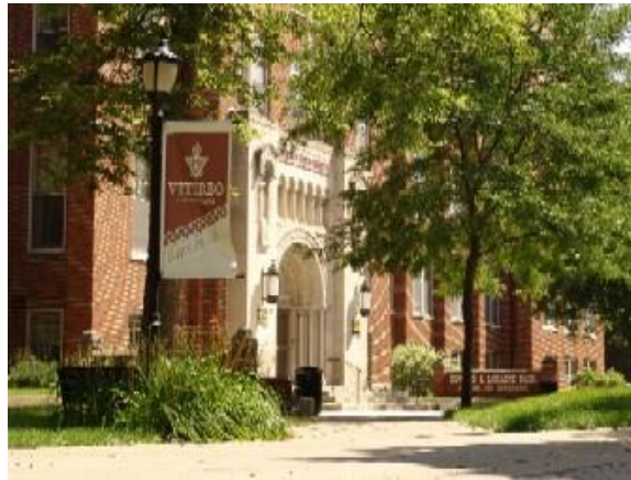
Viterbo University, Murphy Center, La Crosse