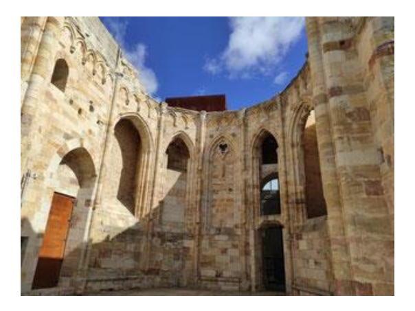
Where You Will Study

The King Afonso Henriques Foundation Campus is located in the former 14<sup>th</sup> century Convent of San Francisco. It has been renovated with modern amenties that include Student Residency (single and double rooms), Tech equipped Classrooms, Library, Auditorium- Theather, three Simultaneous Interpretation Cabins, Cafeteria, and an Art Gallery. Students will reside on campus.