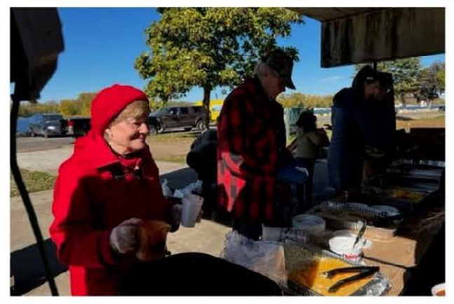
Thank you to all who contributed through their prayers, generous contributions (food, supplies, funds, and time), and serving our neighbors at Houska Park. Our Sept. and Oct. meal dates were a huge success. Keep an eye out for more ways to get involved in the future!